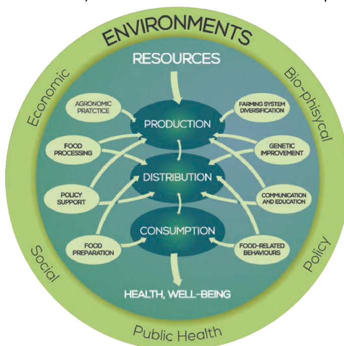
The food system.

When we talk about the food system , we are referring at all activities, actors and interactions that embrace all the elements (environment, people, inputs, processes, infrastructure, institutions, markets and trade) related to the food chain and the outputs of these activities, including socio-environmental economic and outcomes.